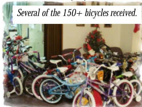
Several of the 150+ bicycles received.