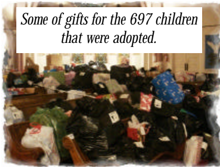
Some of gifts for the 697 children that were adopted.

"I wonder as I wander out under the sky How Jesus the Savior did come for to die For poor on'ry people like you and like I; I wonder as I wander out under the sky."