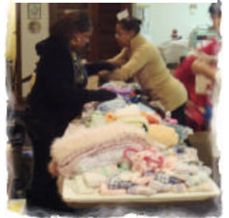
Volunteers organize the table of Mitten Tree Items

Poor can also be described as an expression of tenderness, compassion. Yes, we are poor on'ry people. The song goes on to say that if Jesus wanted anything, absolutely anything, he surely could have it, 'cause he was the King. Jesus wanted these families to experience the enchantment of Christmas. He knew you were going to be part of helping to make this happen even before you made the decision to do so. That is how He wanted it, 'cause He is still the King.