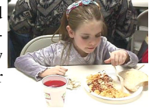
One of our Mission Rejoice children enjoying dinner prepared by a host church.