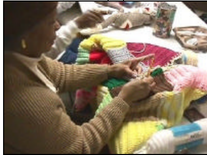
Hard at work making blankets for those in need.

A few of our valuable volunteers prefer to work on small items. We receive boxes of beautiful baby sweaters, blankets, and tiny hats that would fit an orange from out of town volunteers several times a year. The baby items are given to needy families. Preemie sizes are especially hard to find, so we are always thankful to receive those.